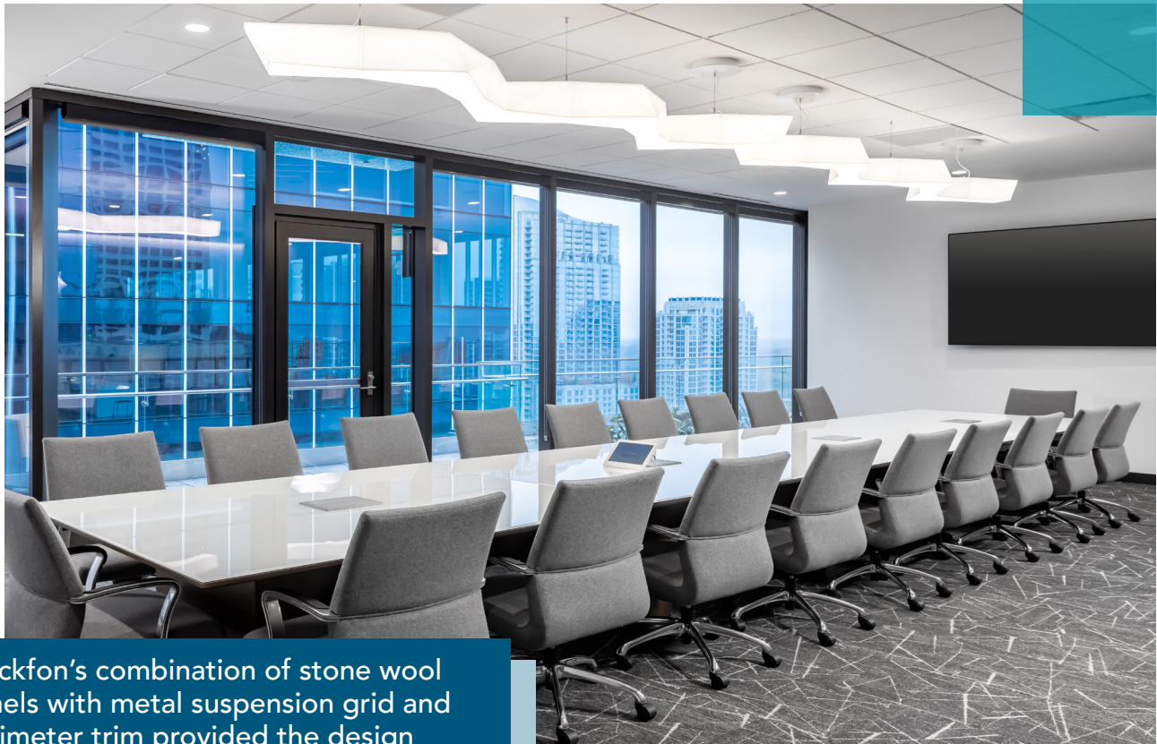
Rockfon's combination of stone wool panels with metal suspension grid and perimeter trim provided the design flexibility, acoustic optimization and sustainable attributes required for the high-tech, highly collaborative setting.

Respecting the variety of individual workstyles and tasks, private offices and quiet nooks designate separate areas for concentration and one-on-one conversations. Optimized acoustics was an important consideration within this interconnected office environment. Nelson and Newcomb & Boyd guided the acoustic performance requirements throughout the interiors.